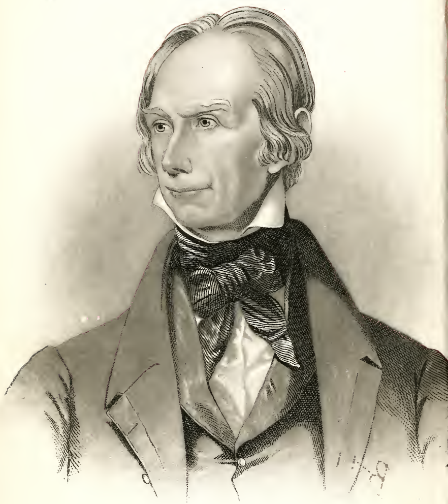
A SCOTTISH MAN